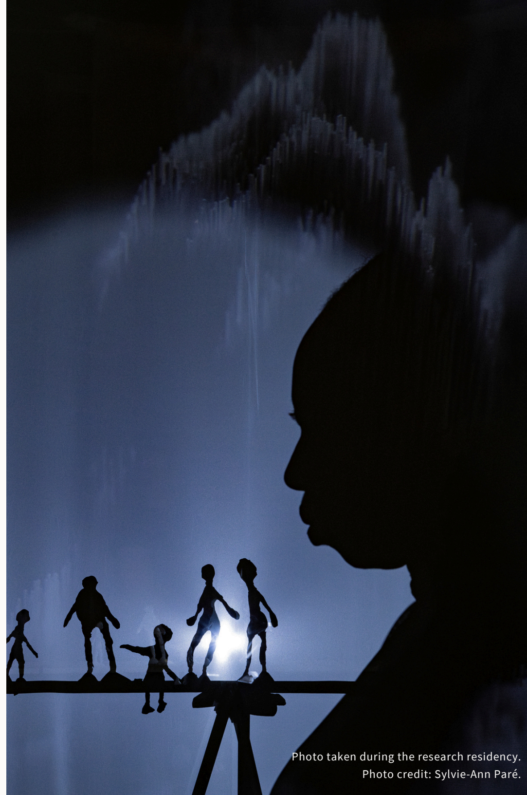
Photo taken during the research residency.